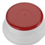
Red blanking cap (LID100-SG/R)