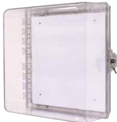
STI-7530 with Key Lock